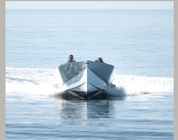
SAY Carbon Yachts designed an unique “wave cutting” bow.

SAY Carbon Yachts constructs stylish powerboats with hulls made of 100% carbon fibre. This makes all vessels fast, solid and economical. SAY uses reliable standard fibres from classes T300 and T700 with individual layer weights between 200 and 800 grams. Thanks to this it allows sports car-like acceleration.